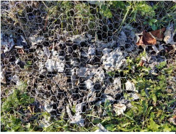
Figure 2. Downy mildew leaves under chicken wire

All applications were made to the point of saturation (approximately 0.8 gallons per plot). The compost used was a commercial blend from Miracle Grow called “Nature’s Care” and was composted from yard waste, manure, mushroom compost, and food waste. The compost tea was made by placing 2 lbs of the commercially made compost into a mesh paint strainer bag and then placing the bag into a 5 gallon bucket of tap water. The compost was left to steep anaerobically for 7 days at which time it was applied to the plots undiluted.