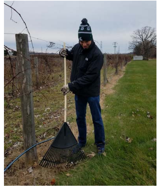
Figure 4. Leaf removal

To provide further proof of the efficacy of leaf treatments on the reduction of disease as a viable way to control disease, a leaf removal trial is being conducted in a vineyard with powdery and downy mildew pressure to determine the effects of inoculum removal. In October 2017, leaves were completely removed from 10 foot sections of a vineyard and replicated 4 times (Figure 4). In similar sections of the vineyard, the leaves were left undisturbed. The treatments (leaf removal vs. no leaf removal) will be rated for powdery mildew and downy mildew onset and disease pressure every 2 weeks starting in late spring through summer of 2018. It is expected that removal of leaves should reduce both disease onset and disease pressure. This would provide further proof that leaf treatments (as tested in objective 1) that speed up leaf decomposition will reduce disease.