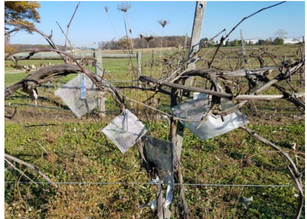
Figure 1. Mesh bags with inoculum

Immediately after the solutions were made, the inoculum filled mesh bags were soaked in the appropriate solution for 5 min then removed and air dried. The following day, the mesh bags were hung approximately 4 ft above the ground on grapevines in a mature vineyard (Figure 1). In the case of black rot, two bags were made for each treatment and one bag was hung above the ground and one bag was pinned to the ground under the vine. All treatment/fungicide combinations were replicated 4 times.